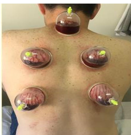
Figure 1: Wet hijamah therapy application

dome elevation one centimeter into the cup on the time of sucking for less than two minutes. Subsequently, the suction stopped and the cup was slowly removed. The cleaned skin was cut in some parallel longitude lines with the sterilized blade along the vertebral column, ~5-7 mm. Once again, cupping was applied. The blood oozed due to suction pressure with a duration of fewer than 3 min. At the end, blood samples were collected for laboratory investigation.